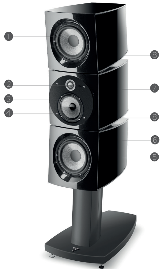
Removable tweeter and woofer grilles